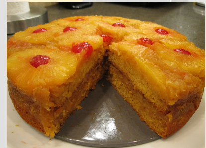
"Three Layer Pineapple Upside Down Cake"