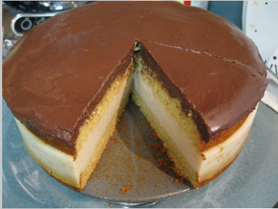
"Boston Creamy Pie"