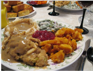
"My Thanksgiving Feast" "Farm Country Cornbread"; "Holiday 'Turkey' & Stuffing Casserole"; "Almost Aunt Jackie's Potatoes"; "Green Bean Casserole"; "Sweet & Festive Cranberry Sauce"; "My Best Mashed Potatoes"; and "Good Gobbler Gravy"